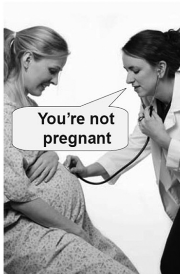
A handy guide to the difference between a false positive and a false negative.

factors; conventional medicine finds these difficult to treat successfully. The Quack hurls himself into the breach.