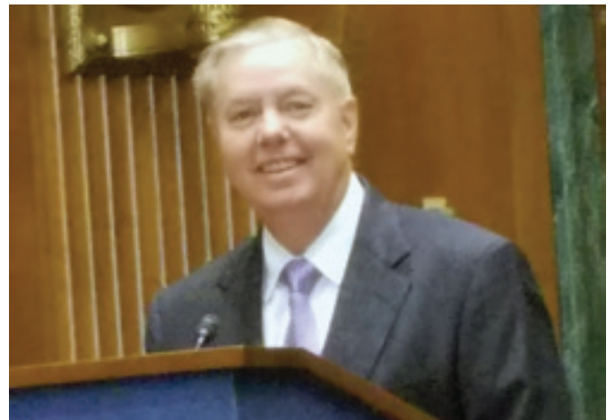
ACSH was at the American Action Forum on Medicare Part D with Senator Lindsey Graham