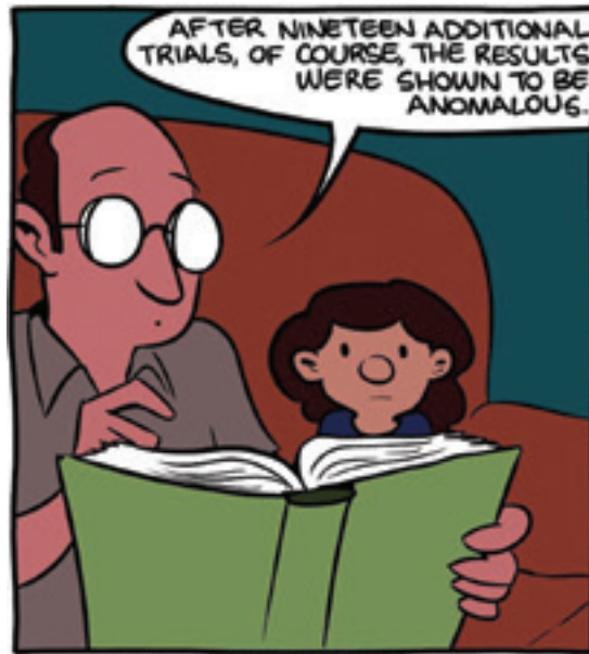
"The Tortoise And The Hare" is actually a fable about small sample sizes.

us in the 1930s, with cheap energy for sanitation, disease plummets. Irrigation happens and food gets cheaper. Air gets cleaner. When less annual income is devoted to basic needs like food and heat, culture improves. Today, culture means access to information through the Internet rather than buildings like libraries but cloud servers alone already consume more power than Germany, the sixth largest power consumer in the world. How can poor countries compete in the 21st century if they are shackled by being told they can't have energy unless they first get enough wealth to live like the energy 1 percent in America?